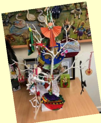
Sharing Christmas traditions and decorations with schools across Europe