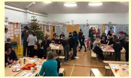
Parents enjoying Christmas Crafts with Dosbarth 3