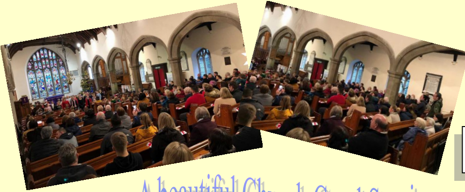
A beautiful Church Carol Service