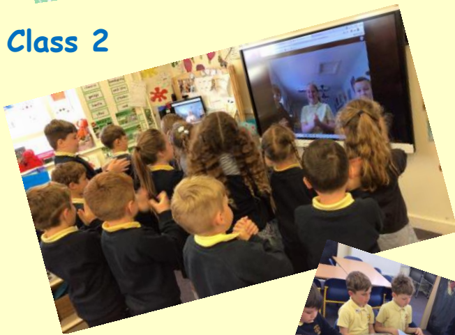
Class 2 taking part in a Welsh session supported by KS2 children in Class 4 by the power of technology!