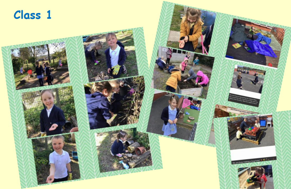
Class 1 exploring the outdoors and continuous provision areas.