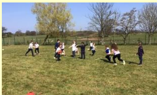
And enjoying getting outside with Wrexham FC in the community, whilst developing their numeracy and literacy skills.