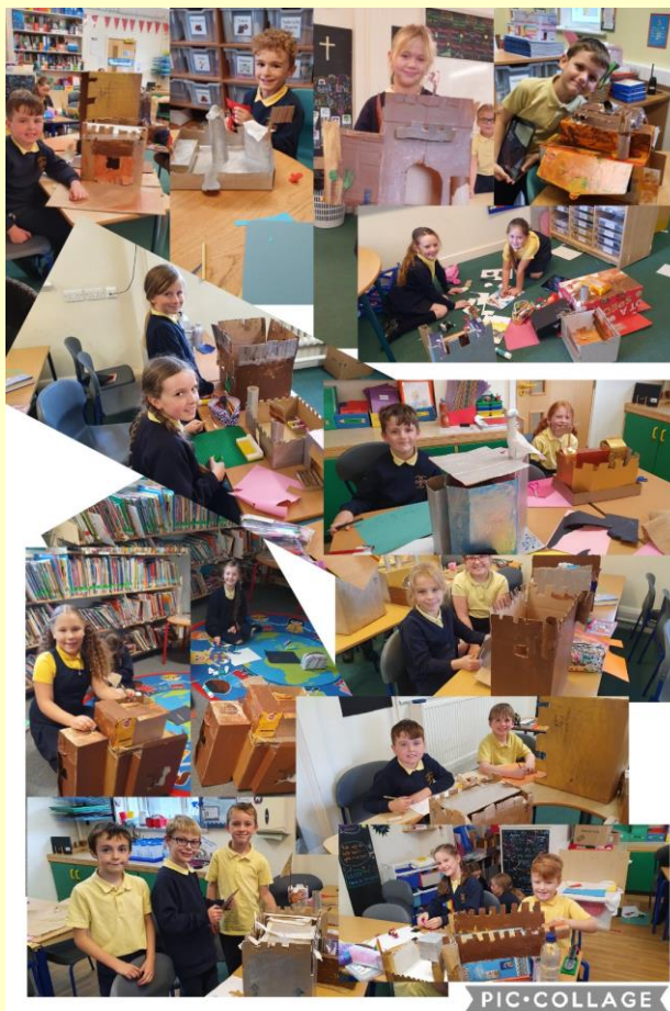
Dosbarth 3 above exploring castles. They even tweeted Gwrych Castle and Ant & Dec about it!

It's true that Covid is still about and we must not be complacent. But together, we can, and will do our best to get through it with minimal disruption.