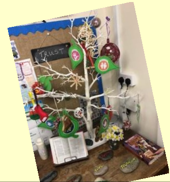
Participating in the Criw Cymraeg Welsh Christmas Tree decoration competition.