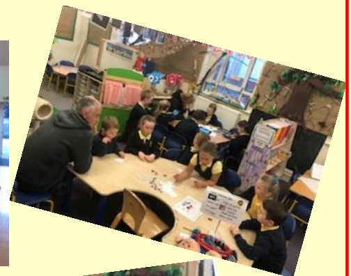
Parents participating in Christmas Craft activities with Key Stage Two classes and the Foundation Phase.