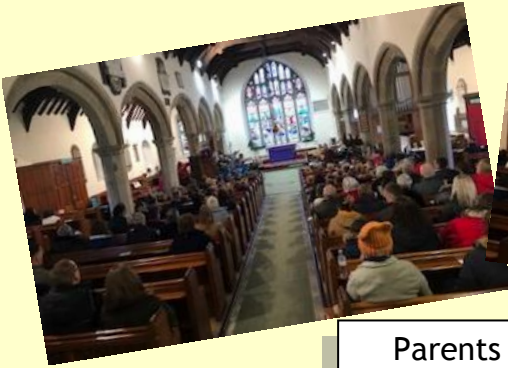
Parents enjoying our Church Carol Service